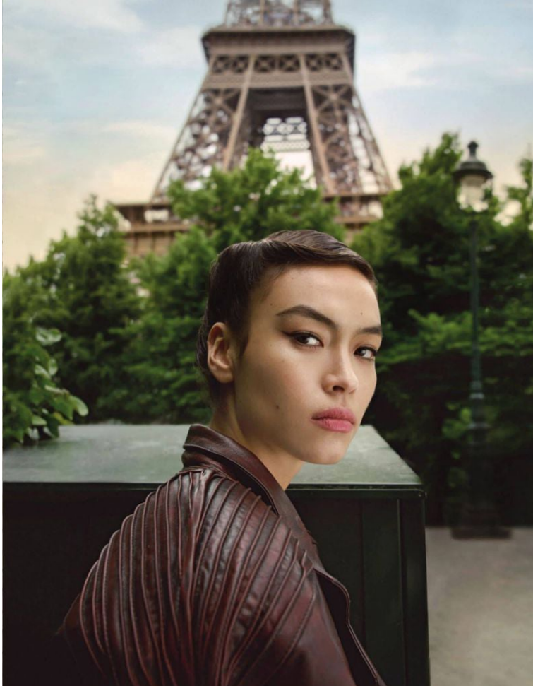
VOGUE ARABIA ↓