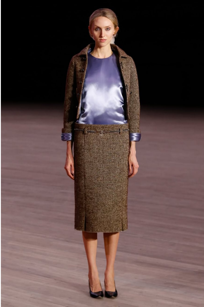
MARC JACOBS ↓