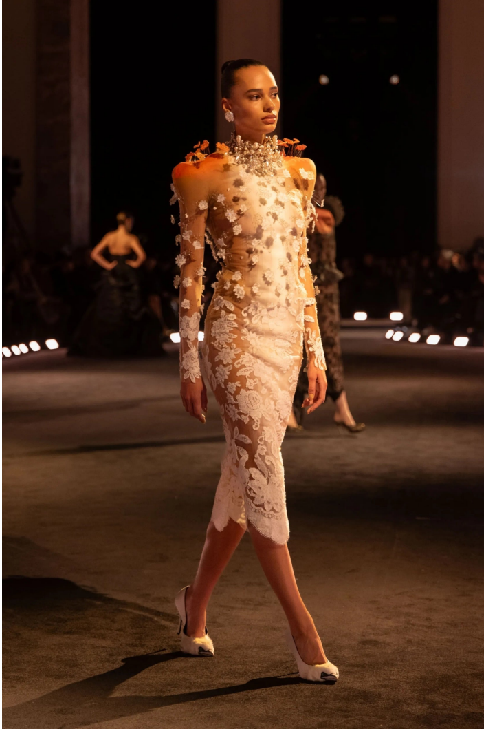
SCHIAPARELLI HAUTE COUTURE ↘