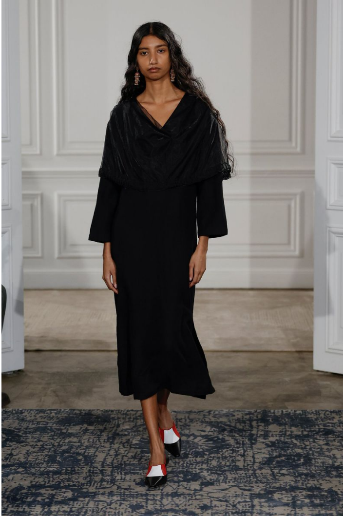
KARTIK RESEARCH ∨