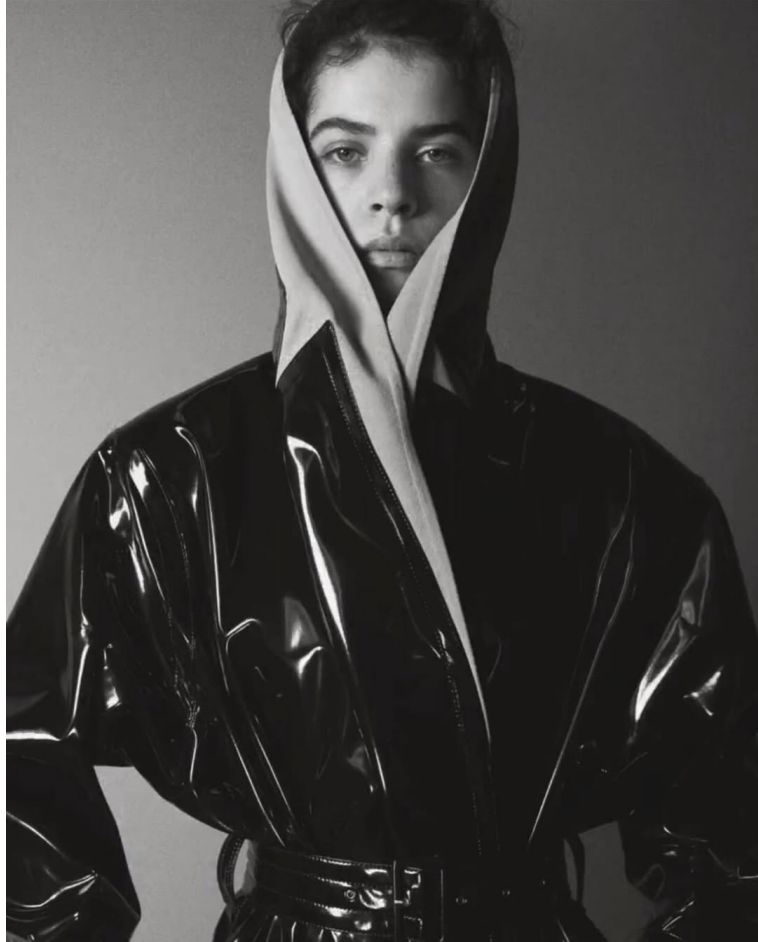
SELF SERVICE ↘