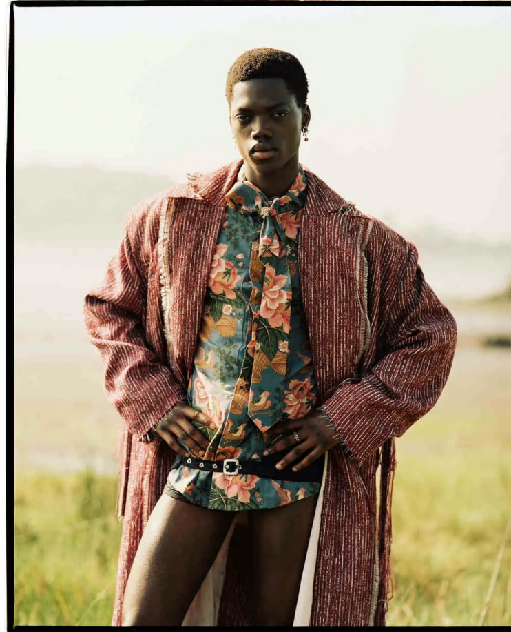
L'OFFICIEL BRASIL ↘